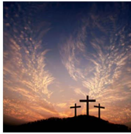
He has risen!